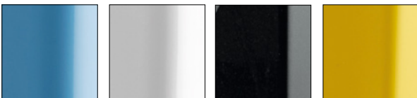
Gauloise Blue Carrara White Black Lacquer Solar Yellow