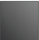
Black High Gloss