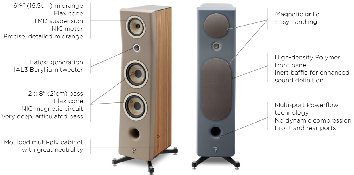
Kanta N°3, Wood Veneer cabinet, Warm Taupe and Dark Grey front panels

Kanta N°3 is the reference product for the line. This 3-way speaker combines depth, impact and articulation in the bass. The heightened midrange definition and neutrality are the result of Flax technology innovations, TMD suspension and NIC. The latest generation IAL tweeter provides the ability to reproduce the tiniest details with clinical precision. With a resolutely modern, ingenious design, this sound equipment will be at its best in a room from 430 to 860ft 2 (40 to 80m 2 ).